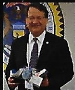
Senator Gary Peters