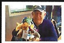
Robin Leach Celebrity Journalist

The World Famous Traveling Shoe, Representing those Suffering from Multiple Atrophy will be coming to your area!