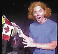
Comedian Carrot Top