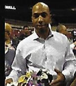
Detroit Piston Star Chauncey Billups