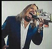
Vince Neil Mötley Crüe